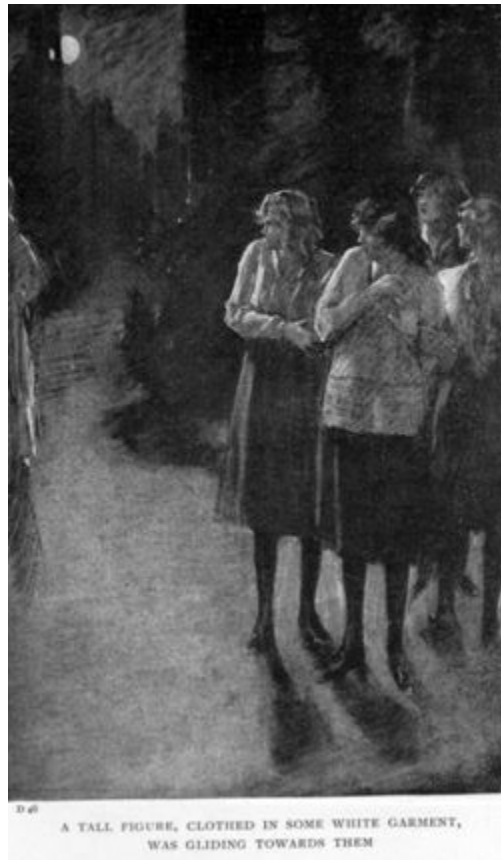
274 A TALL FIGURE, CLOTHED IN SOME WHITE GARMENT, WAS GLIDING TOWARDS THEM