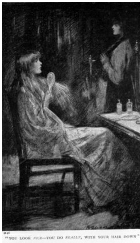
"YOU LOOK NICE--YOU DO REALLY, WITH YOUR HAIR DOWN"