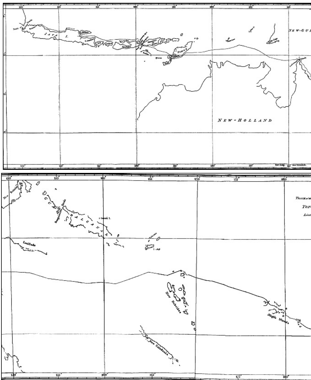
Track of the Bounty 's Launch from Tofoa to Timor by Lieut. William Bligh, 1789

At present, for the better understanding the following pages, it is sufficient to inform the reader, that in August, 1787, I was appointed to command the Bounty , a ship of 215 tons burthen, carrying 4 six-pounders, 4 swivels, and 46 men, including myself and every person on board. We sailed from England in December, 1787, and arrived at Otaheite the 26th of October, 1788. On the 4th of April, 1789, we left Otaheite, with every favourable appearance of completing the object of the voyage, in a manner equal to my most sanguine expectations. At this period the ensuing Narrative commences.