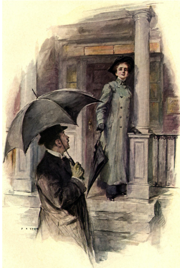
A SUDDEN FIERCE ANGER BURNED IN HER HEART

"There's a favor I want to ask of you, Miss Garrison. Dan talked to me once or twice about your grandfather's estate. He owned some shares in a business I had helped to organize, the White River Canneries. The scheme failed for many reasons; the shares are worthless. I want you to let me pay you back the money Professor Kelton paid for them. I should have to do it privately--it would have to be a matter between you and me."