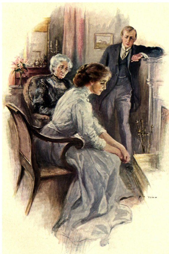
SYLVIA MUST KNOW JUST WHAT WE KNOW

Dan knew what was in her mind. Since that night on Waupegan, blessed forever by Sylvia's tears, the letter found among Professor Kelton's papers had led him through long, intricate mazes of speculation. It was the torn leaf from a book that was worthless without the context; a piece of valuable evidence, but inadmissible unless supported and illuminated by other testimony.