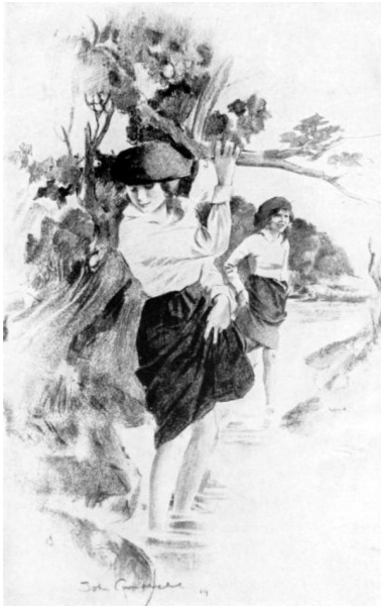
TWO PAIRS OF BARE FEET WENT SPLASHING JOYOUSLY INTO THE BROOK

"Wouldn't I? I believe I'm going to do it now."