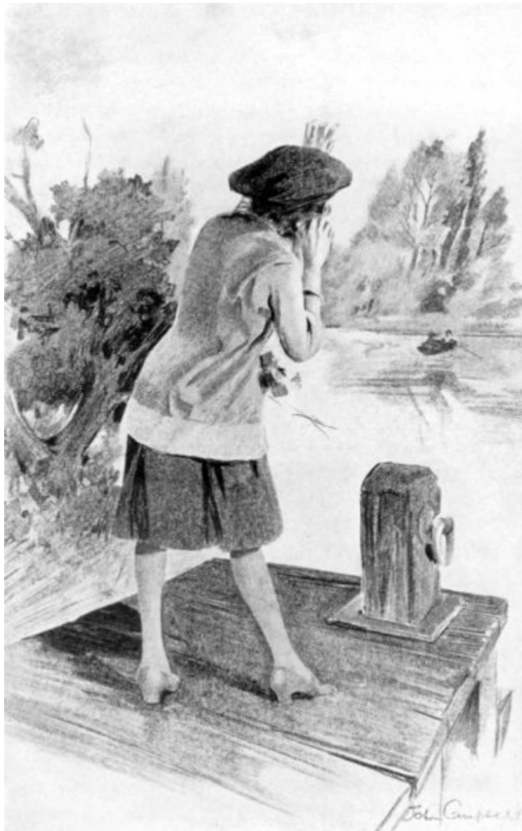
DIANA CALLED AND SHOUTED TO THEM. THEY TOOK NO NOTICE.