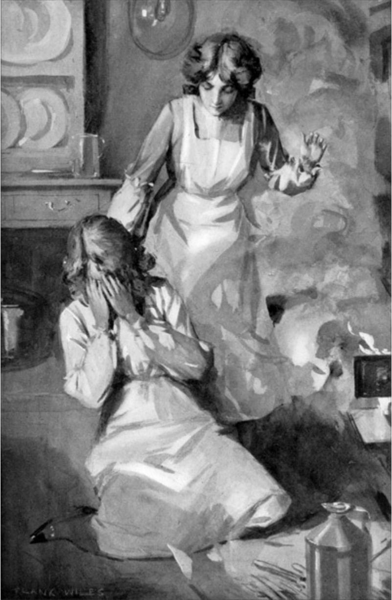
"WITH A SHRIEK SHE DREW SWIFTLY BACK"

An unpleasant surprise awaited them in the kitchen. They had forgotten the very existence of the stove while they were talking, and the fire was out. Until it was rekindled there did not seem much prospect of either cakes or jam. Dora and Aldred hastened to the rescue, while Mabel cleared the table, swept up crumbs, and generally tidied the sitting-room.