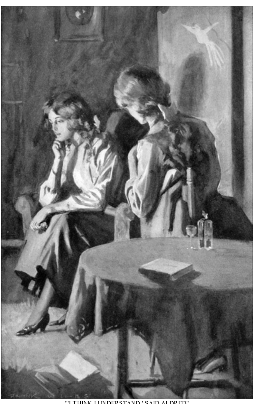
"'I THINK I UNDERSTAND,' SAID ALDRED"

"Oh, please don't! I'd rather have it last of all, if you don't mind."