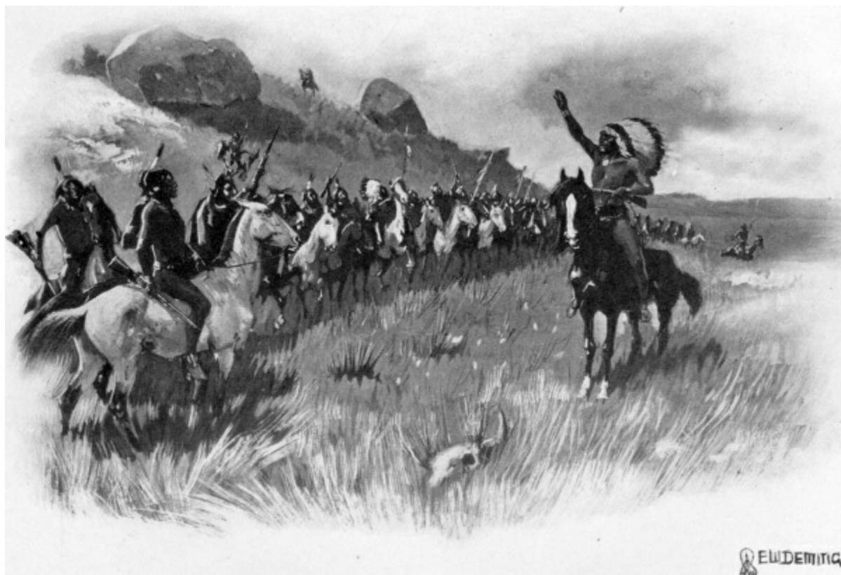
"WITH ONE MAGNIFICENT RED ARM UPLIFTED."

"Why, surely, Field," was the quick reply, as Ray turned toward his junior. "That will make it complete."