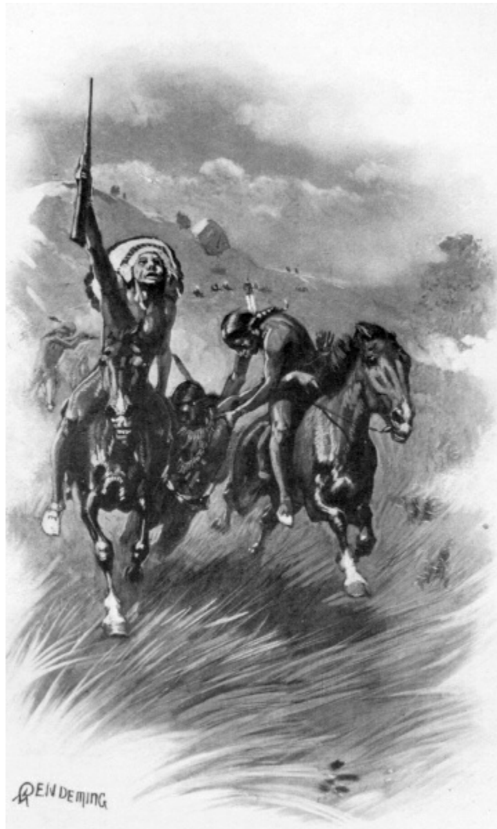
"SOME FEW OF THEIR NUMBER BORNE AWAY BY THEIR COMRADES."