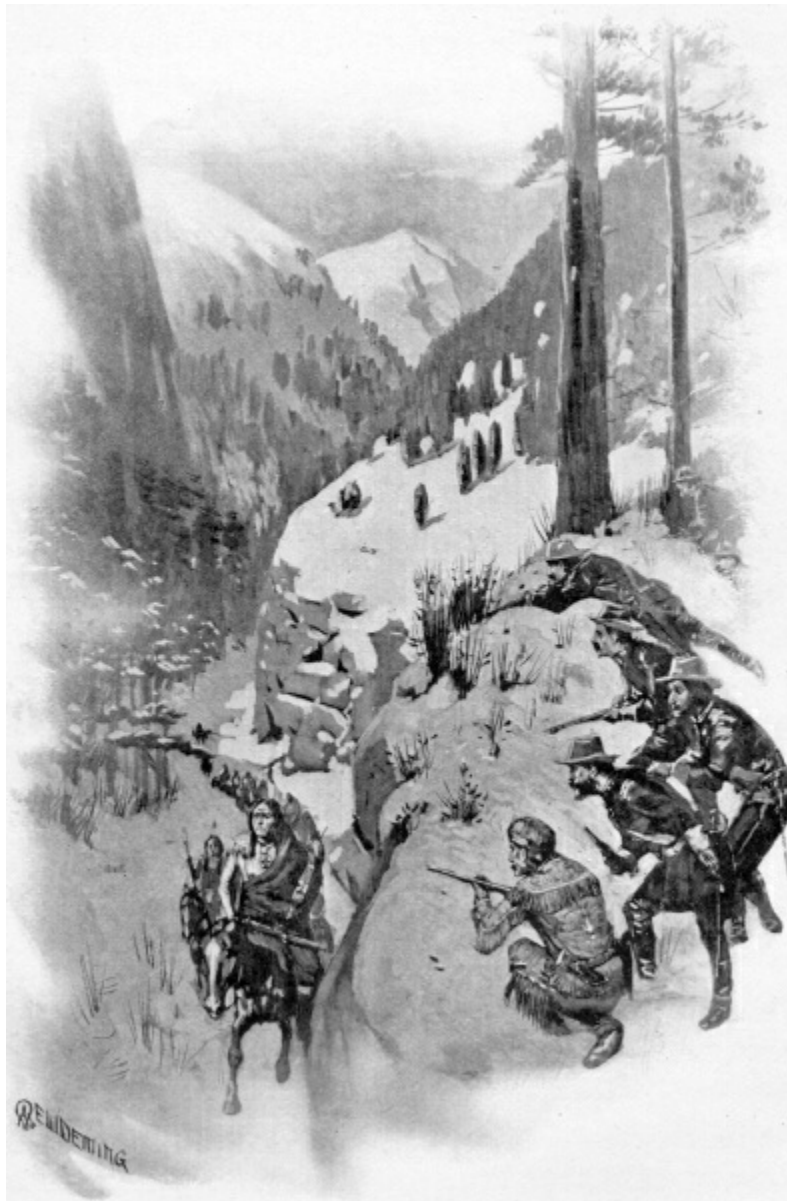
"CHARGE WITH ME THE MOMENT THE LEADERS YELL."