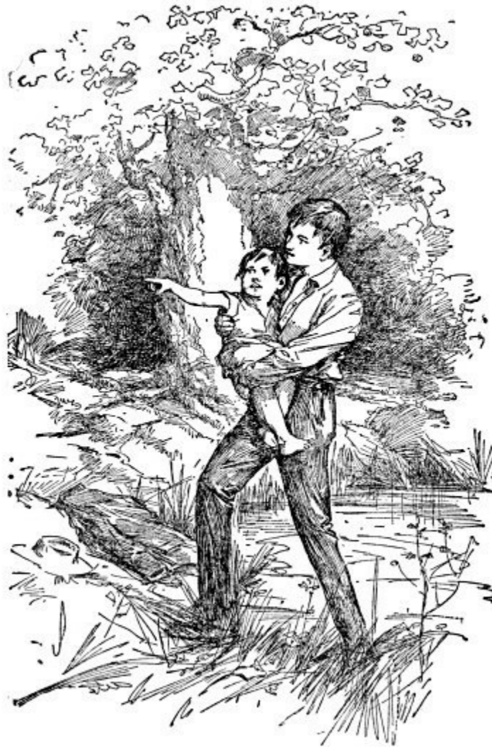
Saving the Indian boy from drowning. (Page 102)