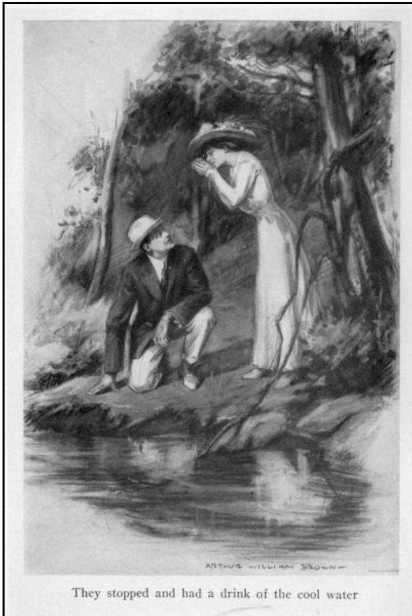
They stopped and had a drink of the cool water

[Frontispiece: They stopped and had a drink of the cool water]