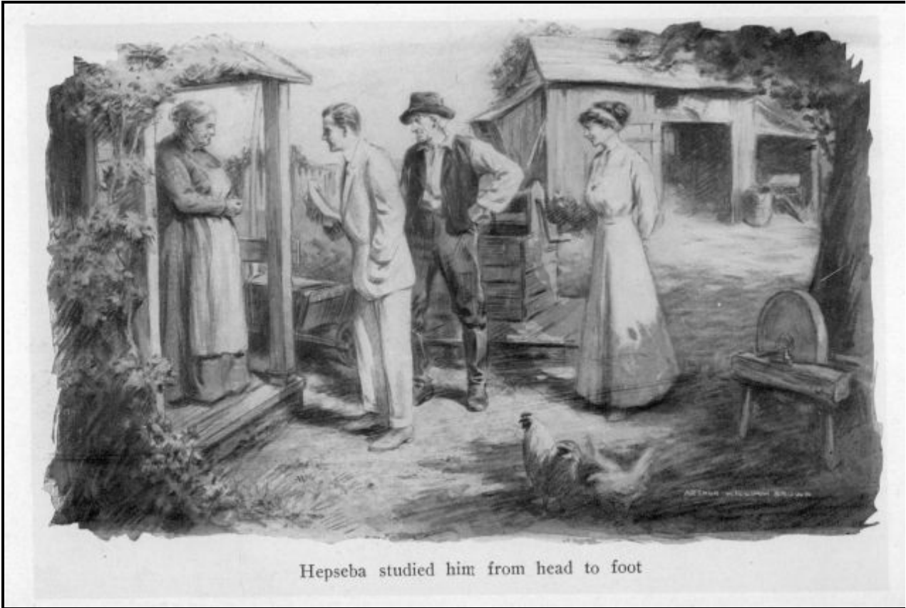
[Illustration: Hepseba studied him from head to foot]

"I like him," finally announced Hepseba, in a surprisingly liquid and feminine voice. "I like both of them," an unexpected turn which brought a flush to the face of Miss Stevens.