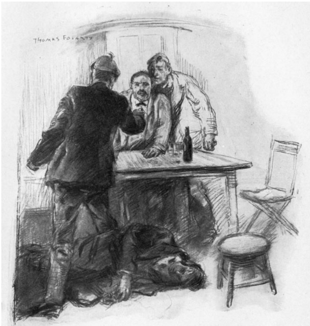
Straddling Mulready's body, he confronted Calendar and Stryker. Page 285

Standing, but leaning heavily upon a hand that rested flat on the table, in the other he likewise held a revolver, which he had apparently drawn in self-defense, at the crisis of Mulready's frenzy. Its muzzle was deflected. He looked Kirkwood over with a cool gray eye, the color gradually returning to his fat, clean-shaven cheeks, replacing the pardonable pallor which had momentarily rested thereon.