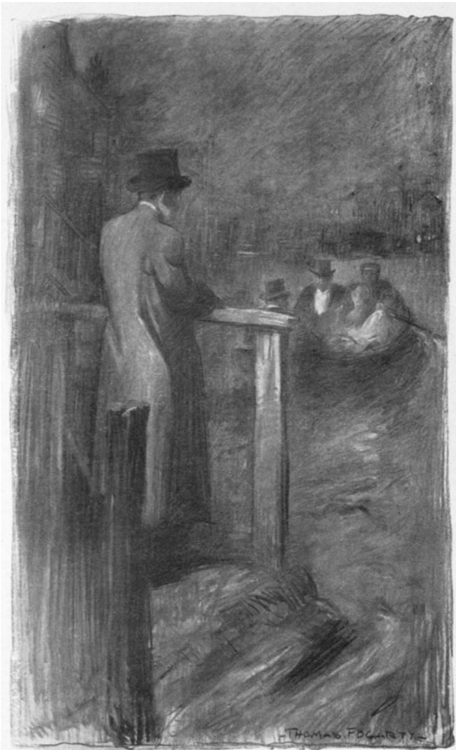
The boat gathered impetus. Page 115

Somewhat wearily the young man released the railing and ascended the stairs. "And that is the end!" he told himself, struggling with an acute sense of personal injury. He had been hardly used. For a few hours his life had been lightened by the ineffable glamor of Romance; mystery and adventure had engaged him, exorcising for the time the Shade of Care; he had served a fair woman and been associated with men whose ways, however questionable, were the ways of courage, hedged thickly about with perils.