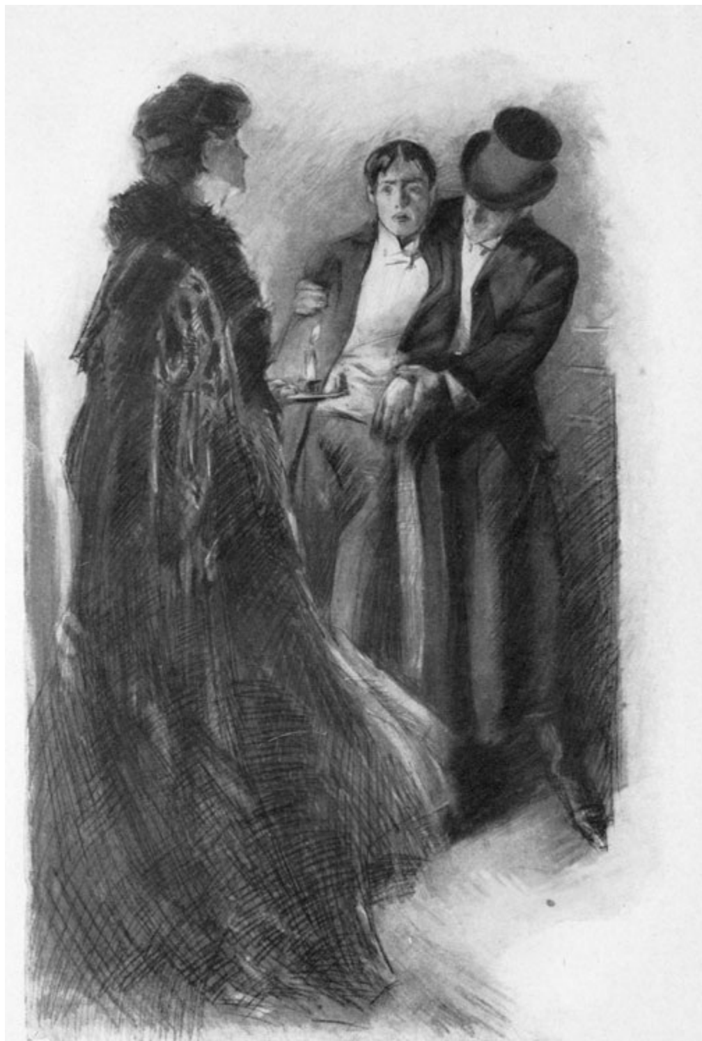
He helped the boy to his feet, and stood waiting. Page 148

He helped the boy to his feet and, while the latter hung upon him and complained querulously, stood waiting for the woman to lead the way with the light; something which, however, she seemed in no haste to do. The pause at length puzzled Kirkwood, and he turned, to find Mrs. Hallam holding the candlestick and regarding him steadily, with much the same expression of furtive mistrust as that with which she had favored him on her own door-stoop.