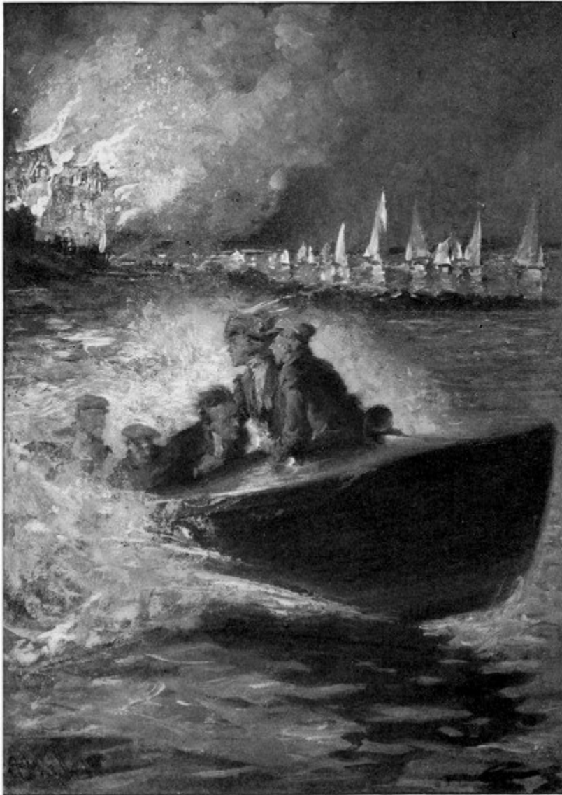
The light of the great fire illumined not only all the island, but the waters for miles around