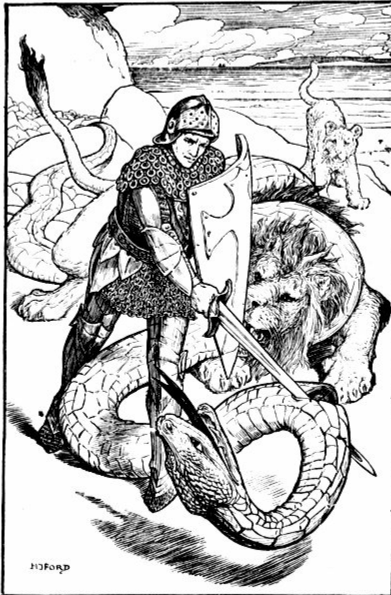
SIR PERCIVALE SLAYS THE SERPENT