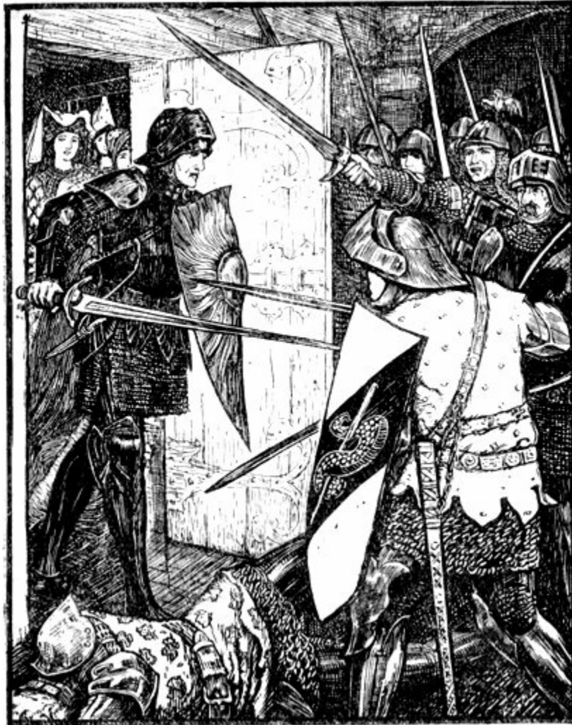
LANCELOT COMES OUT OF GYNEVERE'S ROOM

"Nay, Lancelot," said the Queen, "I will never live after your days, but if you are slain I will take my death as meekly as ever did any Christian Queen." 124