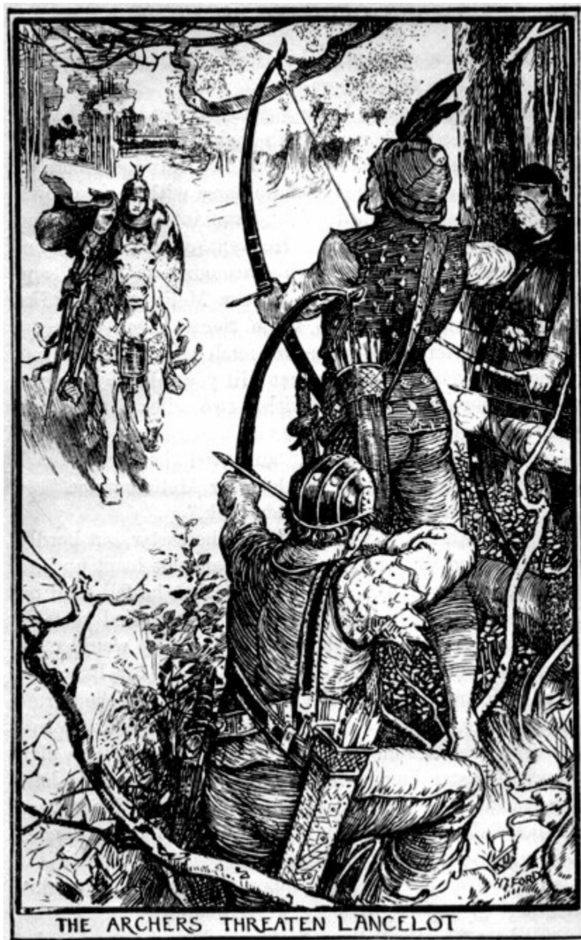
THE ARCHERS THREATEN LANCELOT

"Either you will leave this path or your horse will be slain," answered the archers.