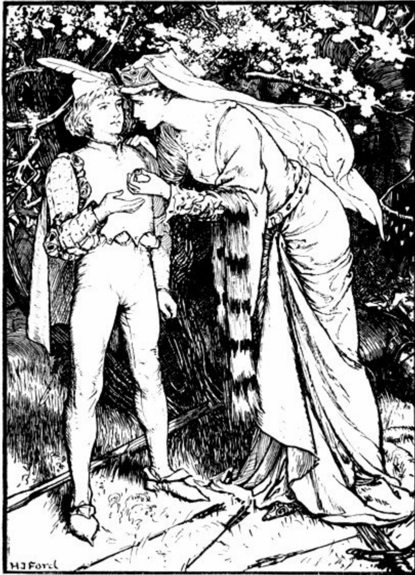
GUENEVERE SENDS HER PAGE TO LANCELOT FOR HELP.

The castle of Sir Meliagraunce was distant seven miles from Westminster, so it did not take long for the boy to find Sir Lancelot, and to give him the Queen's ring and her message. "I am ashamed for ever," said Sir Lancelot, "unless I can rescue that noble lady," and while he put on his armour, he called to the boy to tell him the whole adventure. When he was armed and mounted, he begged the page to warn Sir Lavaine where he had gone, and for what cause. "And pray him, as he loves me, that he follow me to the castle of Sir Meliagraunce, for if I am a living man, he will find me there." 112