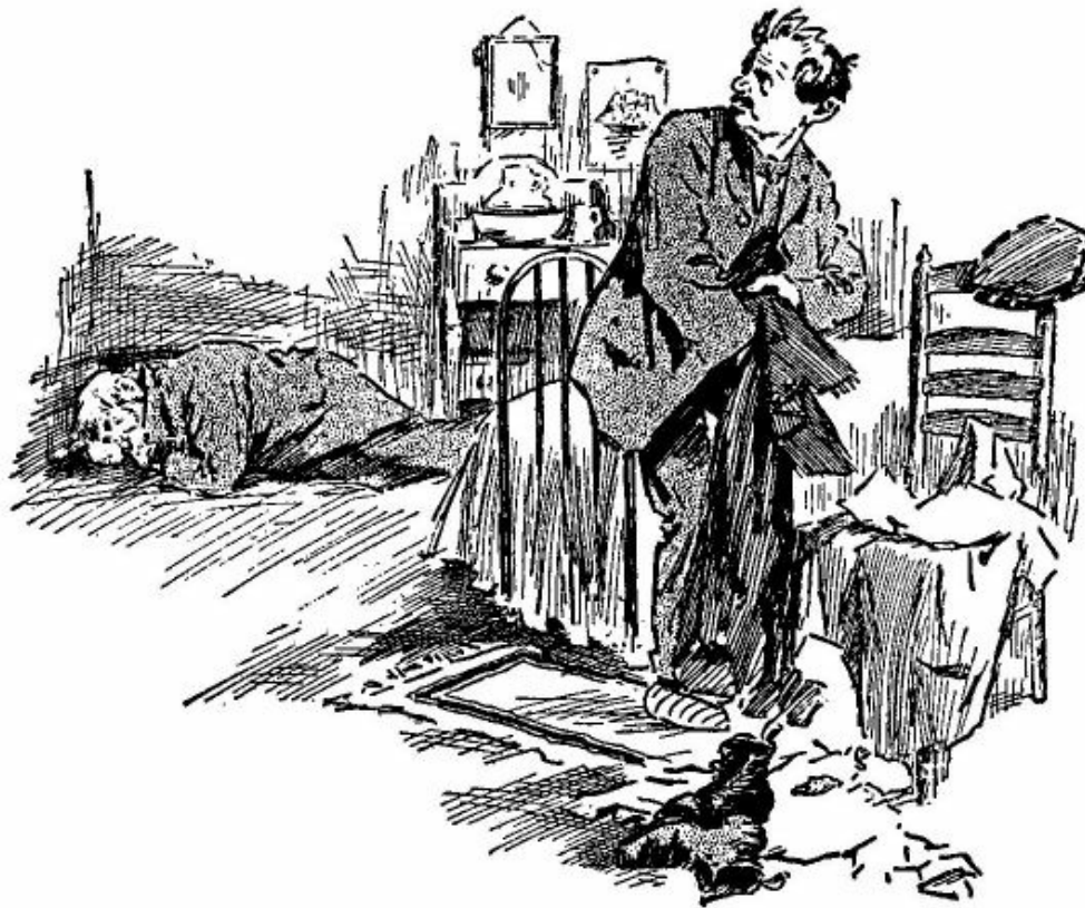
“The lodger was standing at the foot o’ Ginger’s bed, going through ’is pockets”

"He caught 'im up just as he 'ad undone the front door, and, catching hold of 'im by the back o' the neck, shook 'im till 'e was tired. Then he let go of 'im and, holding his fist under 'is nose, told 'im to hand over the money, and look sharp about it.