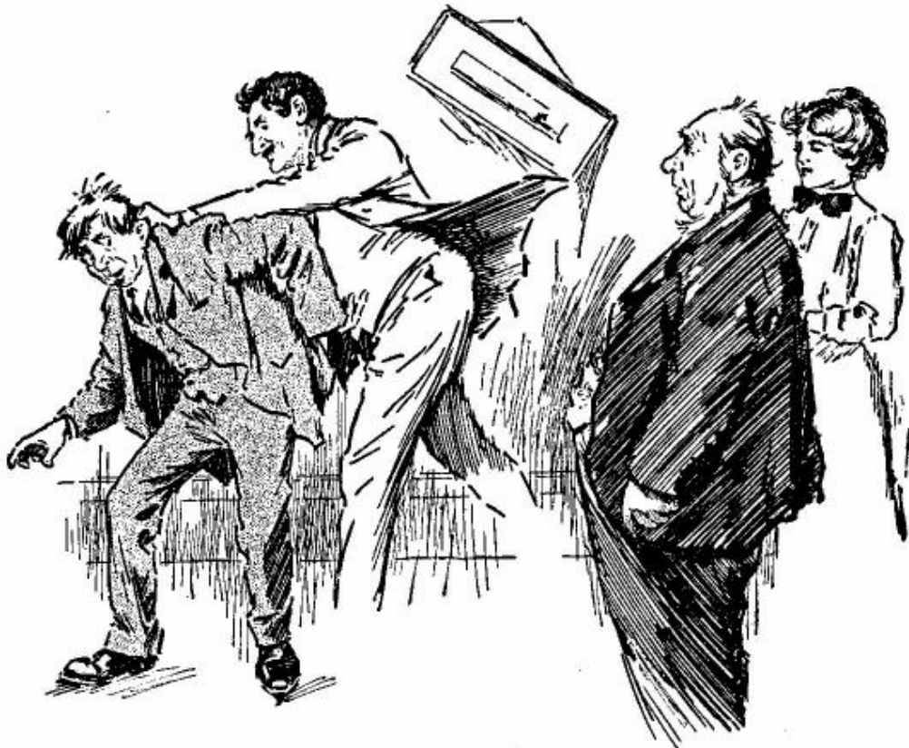
He felt the large and clumsy hand of Mr. Butler take him by the collar

Mr. Sharp rose in a dazed fashion and saw Mr. Culpepper grasp Mr. Butler by the hand. More dazed still, he felt the large and clumsy hand of Mr. Butler take him by the collar and propel him with some violence along the small passage, while another hand, which he dimly recognized as belonging to Mr. Culpepper, was inserted in the small of his back. Then the front door opened and he was thrust out into the night. The door closed, and a low feminine laugh sounded from a window above.