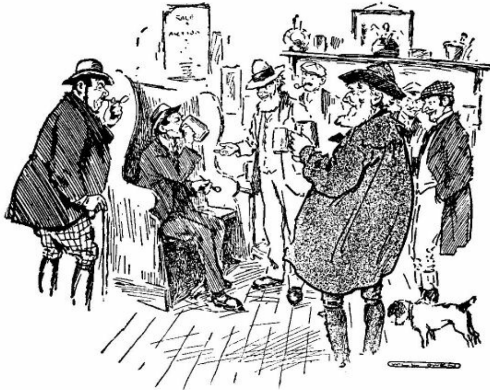
“The quietest man o' the whole lot was Bob Pretty”

"'It's no good to me,' he ses, shaking his 'ead. 'I'm a pore labourin' man, and I know my place.'