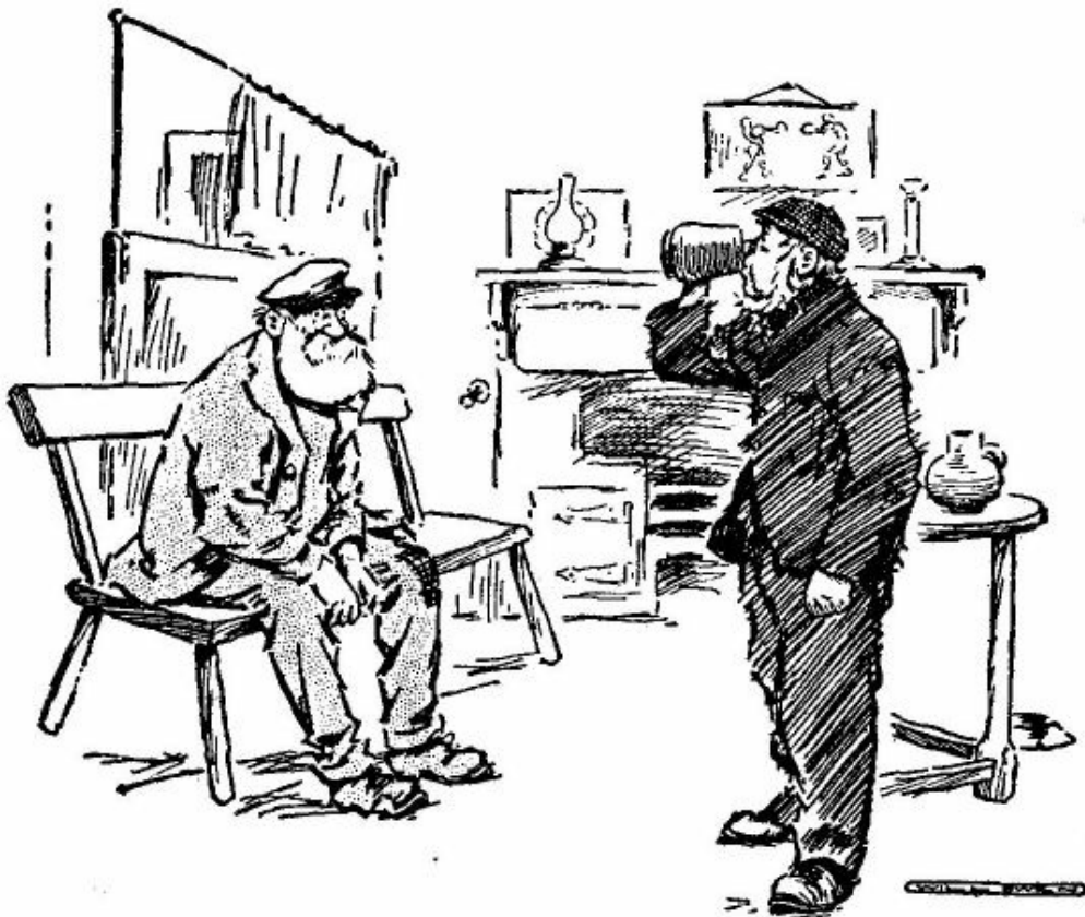
His friend complied

His friend complied. A more tactful man might have taken longer over the job, but Mr. Benjamin Davis, who appeared to be labouring under some strong excitement, took no notice.