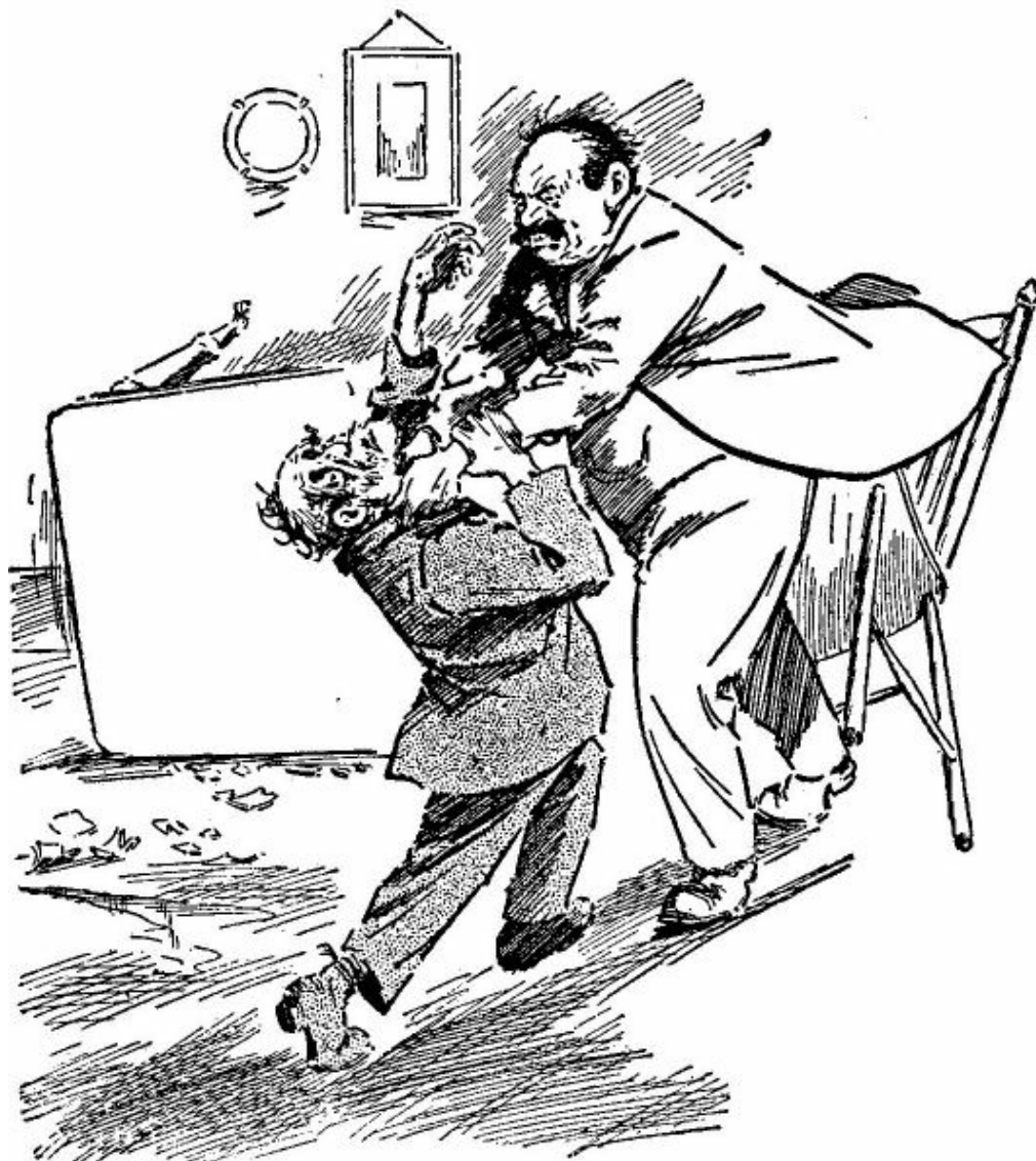
Mr. Chase, with his friend in his powerful grasp, was doing his best, as he expressed it, to shake the life out of him

Speechless with fury, Mr. Teak struck at him. The next moment the supper-table was overturned with a crash, and Mr. Chase, with his friend in his powerful grasp, was doing his best, as he expressed it, to shake the life out of him. A faint scream sounded from above, steps pattered on the stairs, and Mrs. Teak, with a red shawl round her shoulders, burst hurriedly into the room. Mr. Chase released Mr. Teak, opened his mouth to speak, and then, thinking better of it, dashed into the passage, took his hat from the peg, and, slamming the front door with extraordinary violence, departed.