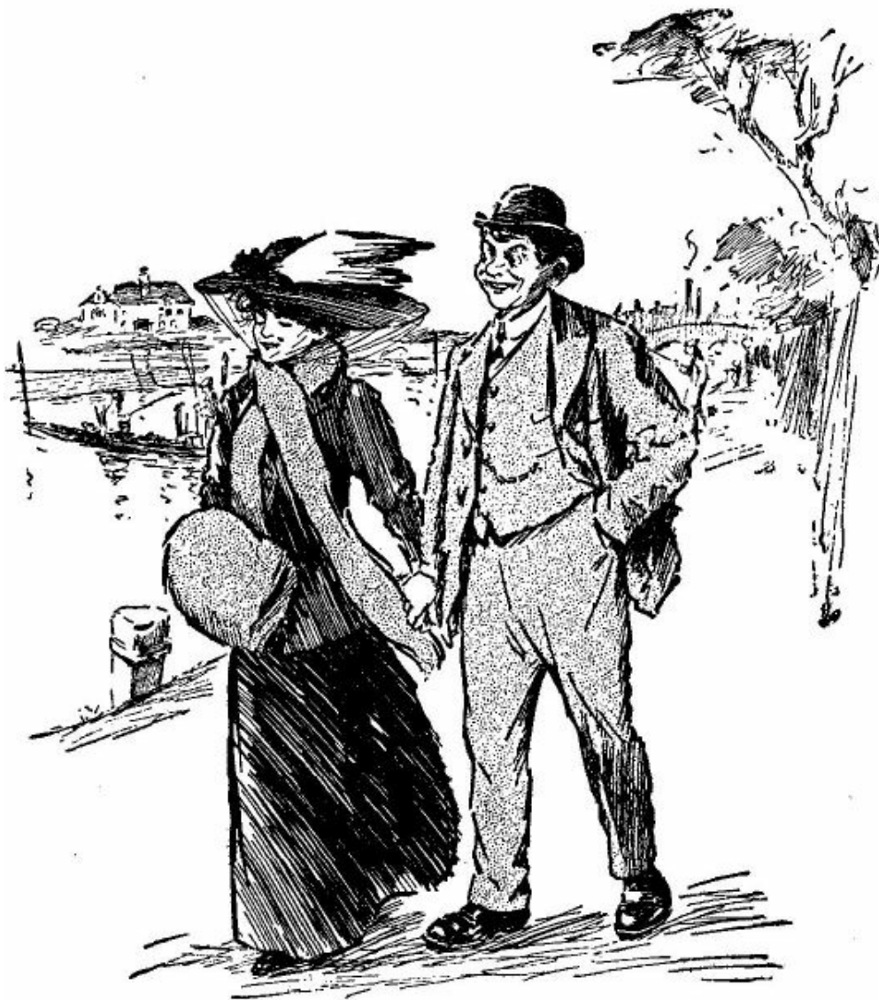
A very faint squeeze in return decided him

"It will come all right afterwards," said Miss Garland, "especially with the hold it will give aunt over him."