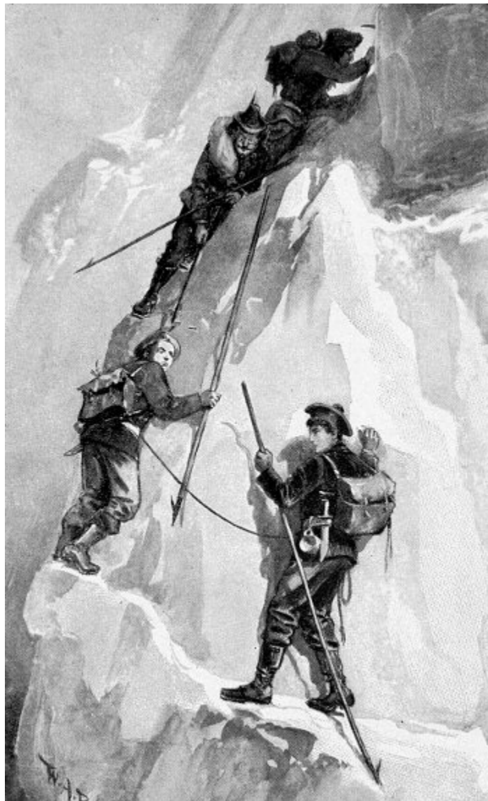
THE ICE ABOVE GIBRALTAR

NEW YORK AND LONDON HARPER & BROTHERS PUBLISHERS