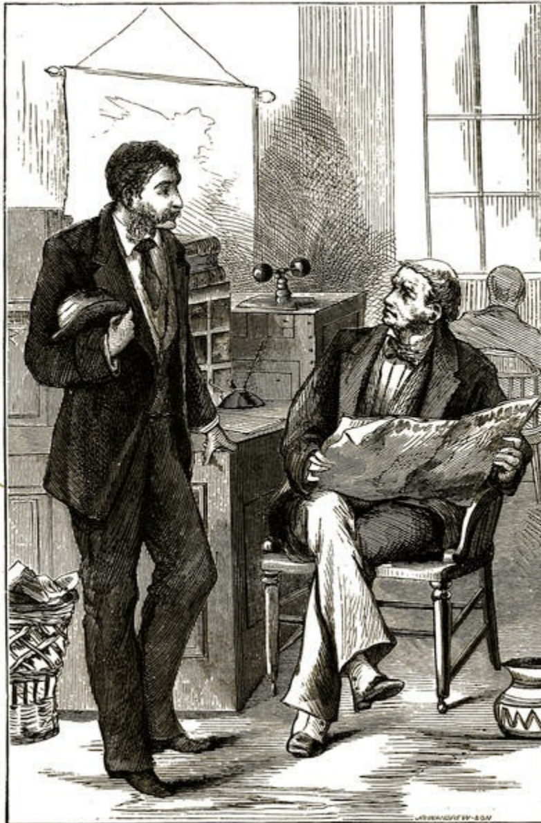
I CALL UPON MY UNCLE. Page 45.

"By the way, uncle--I'm sorry to trouble you, but--could you lend me three hundred dollars for a few weeks?"