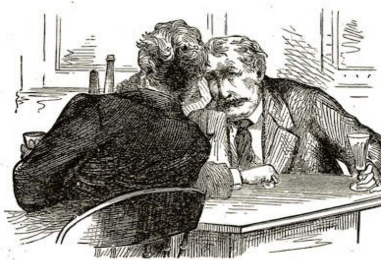
Cormorin and I.

He looked at me steadily, and appeared to be uncertain whether to say anything more or not. He was struggling to reach some point, though I could not imagine what it was. I began to suspect that he wanted to borrow some money of me. If he did, he had come to the wrong man. He labored heavily, like a ship in a storm, and I was beginning to be rather impatient at the slowness with which he proceeded.