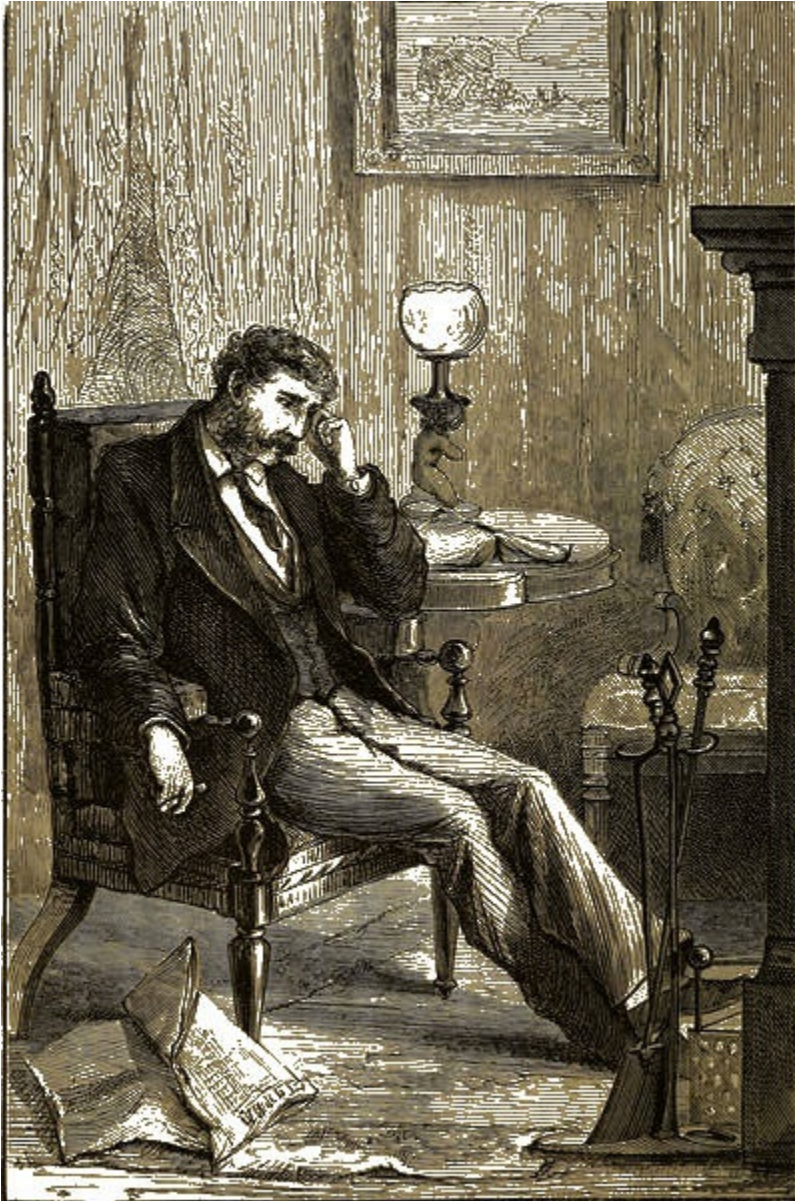
A LONELY HOUSE. Page 40.