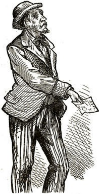
Shaytop's Little Bill.

frame of mind. I didn't "cotton" to any such sum as that, and Mr. Bristlebach, the president of the bank, who was reputed to be worth a million, could not have looked more magnificent than I did, if he had tried.