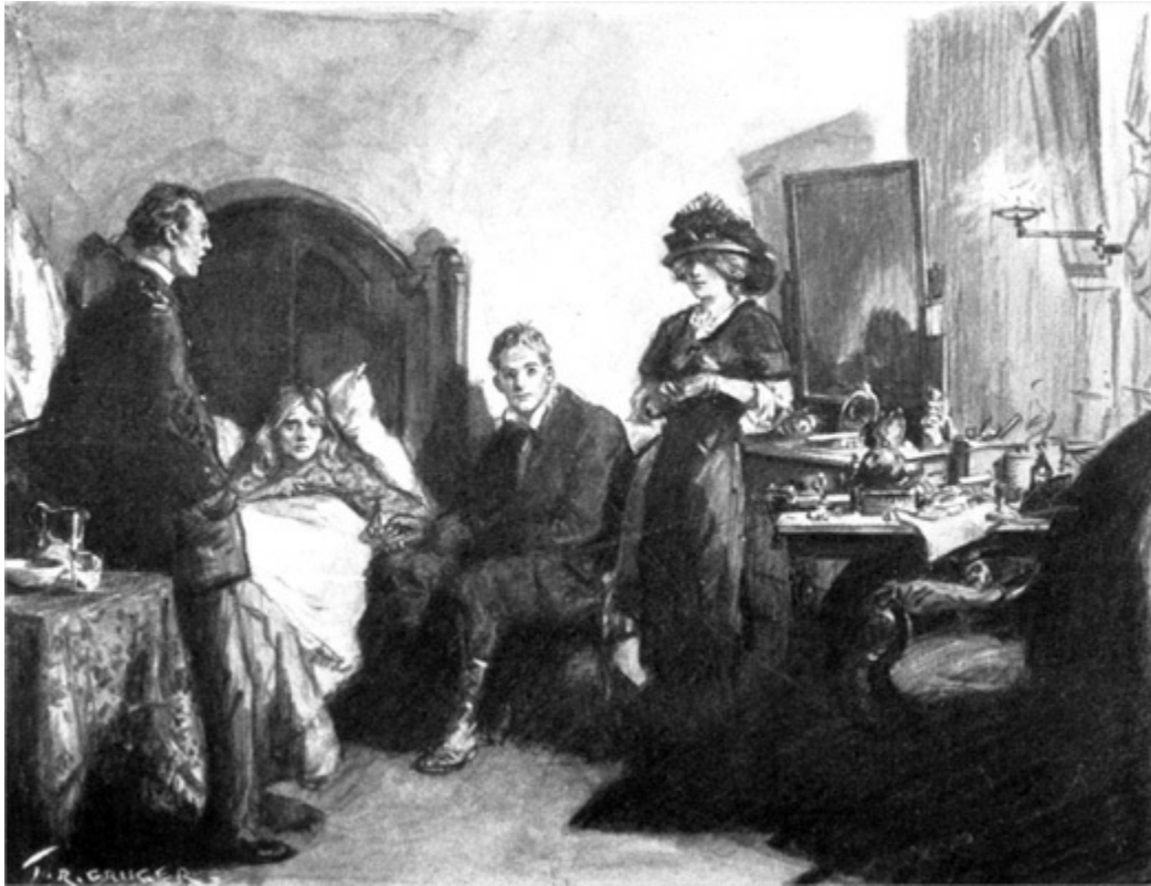
SHE HELD UP A HAND AS LIGHT AS A LEAF, AND HE TOOK IT IN A WIDE, GENTLE CLASP THAT ENVELOPED IT