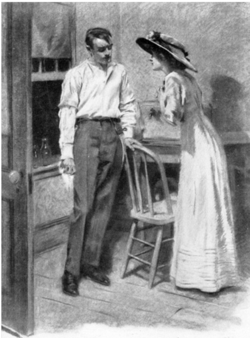
"I WENT OVER TO LOO'S, AND WE STAYED UP AND TALKED SO LATE--I DIDN'T KNOW--"

She stopped at the sight of his face; her fear returned.