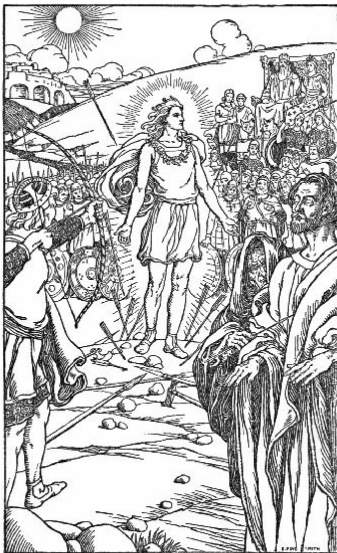
EACH ARROW OVERSHOT HIS HEAD

Now among the crowd that watched these games with such enthusiasm, there was one face that did not smile, one voice that did not rasp itself hoarse with cheering. Loki saw how every one and every thing loved Balder, and he was jealous. He was the only creature in all the world that hated Balder and wished for his death. Yet Balder had never done harm to him. But the wicked plan that Loki had been cherishing was almost ripe, and in this poison fruit was the seed of the greatest sorrow that Asgard had ever known.