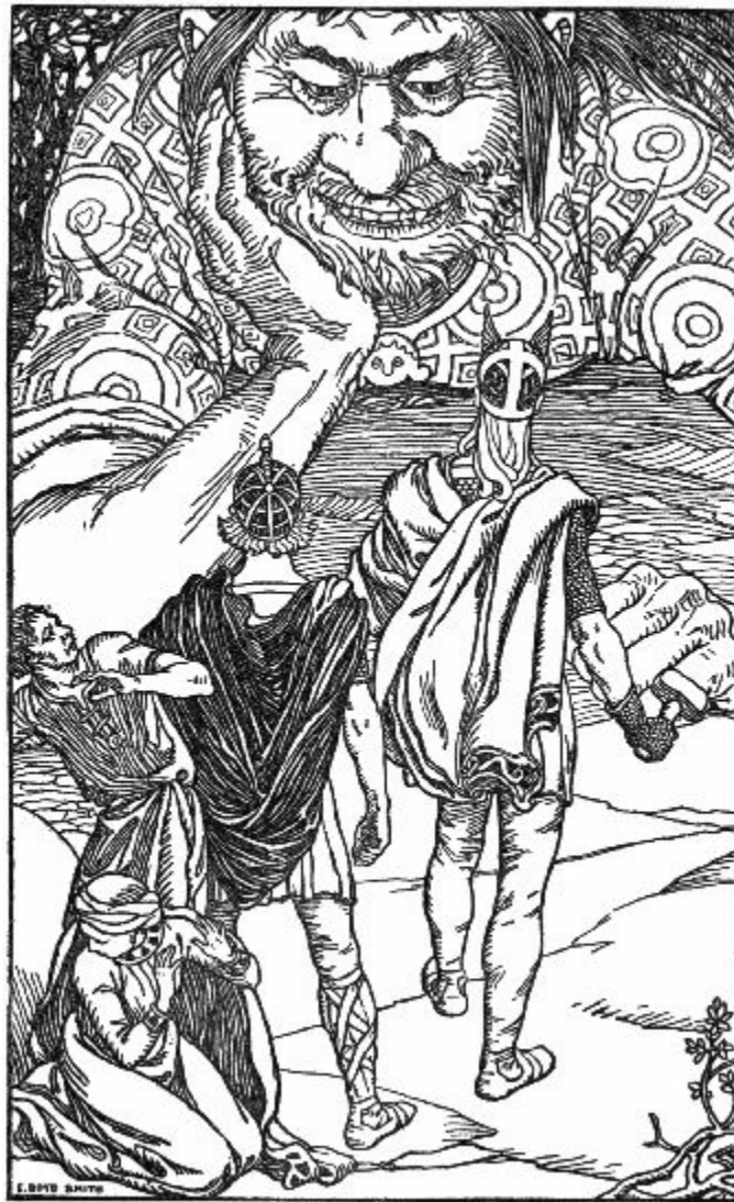
"I AM THE GIANT SKRYMIR" (page 150)

♣ ♣ ♣ IN THE DAYS OF GIANTS ♣ ♣ A BOOK OF NORSE TALES BY ABBIE FARWELL BROWN ♣ ♣ WITH ILLUSTRATIONS BY E. BOYD SMITH ♣ ♣