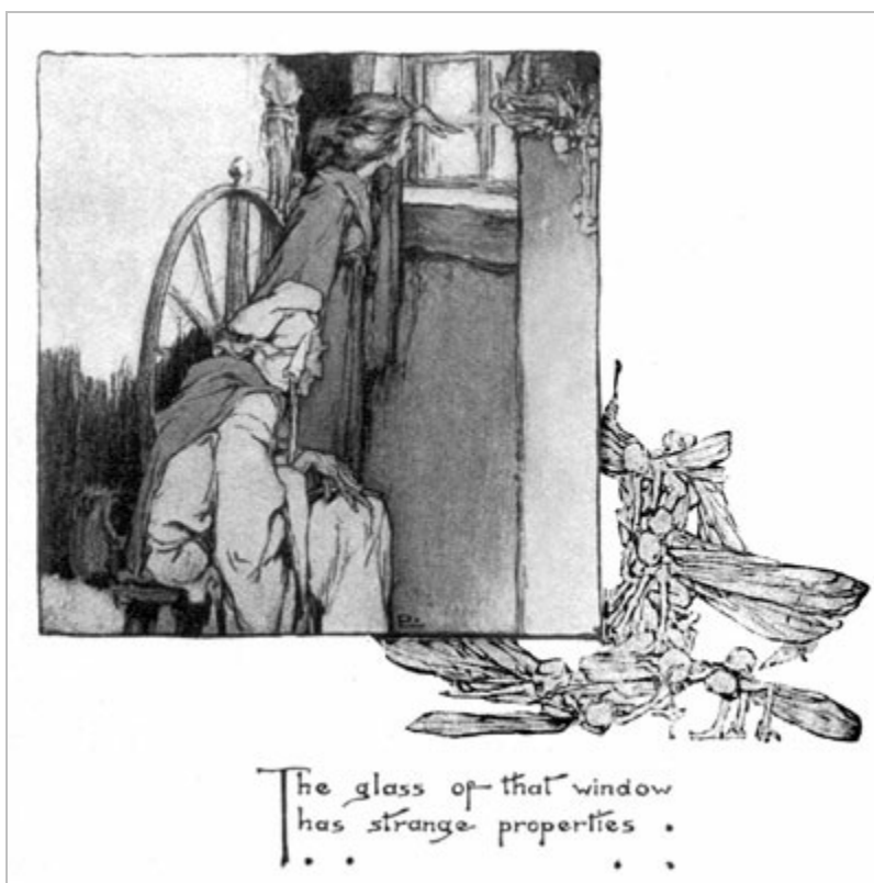
The glass of that window has strange properties.

"Do I remember it?" she repeated, "can I ever forget it? A year of my life has gone into it. The year that I was married."