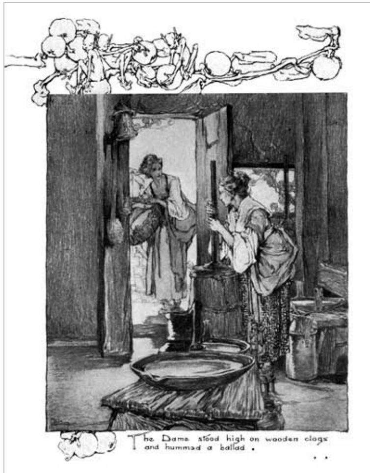
The Dame stood high on wooden clogs and hummed a ballad.

In the cool stone dairy the Dame stood at work, pressing and patting at the soft coloured butter. Beaded brown jars of cream were by her and great, fair pans of milk, mounds and balls of primrose-tinted butter, white cheeses wrapped in grape-leaves, clotted cream that quivered at a touch, tall pitchers of whey, loppered milk ready for the spoon and buttermilk in new-washed churns. Through the moist freshness of the stone room the brook ran, chuckling and lapping; great stones roughly mortared together made the floor on either side of it; the Dame stood high on wooden clogs and hummed a ballad wherein the birds sang in the morning, but at night the eggs were broken, and the wind was high and scattered the fledglings.