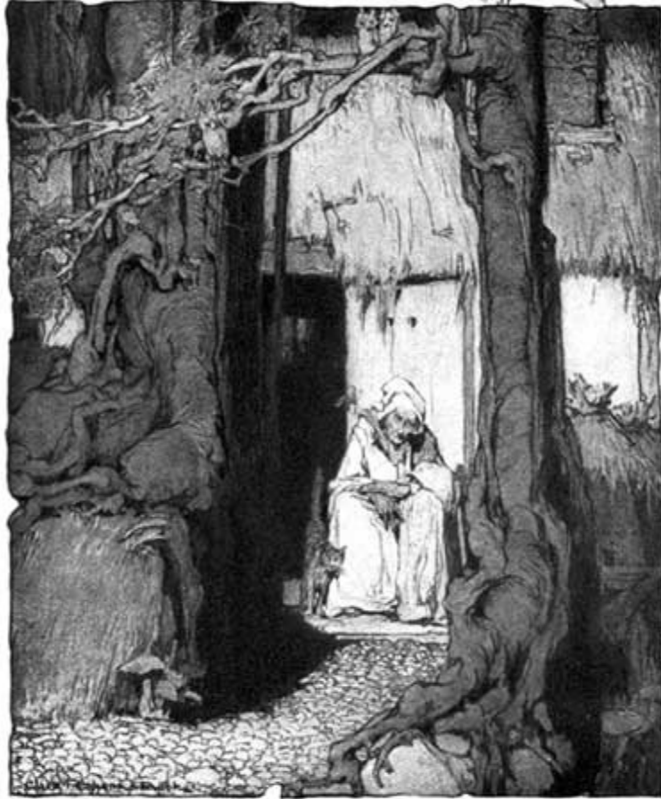
On a low stool there sat an old woman. . .