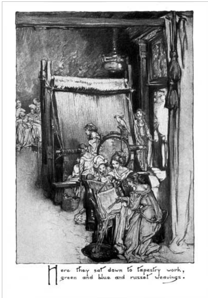
Here they sat down to tapestry work, green and blue and russet weavings.

"You will never make a huntsman at that rate, Alys--one would think him standing on his horse."