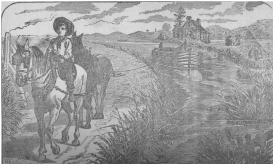
The Canal Boy

His answer was a volley of oaths and curses that made James turn pale, for he had never uttered an oath in his life, and had never listened to anything so disgusting as the tirade to which he was forced to listen.