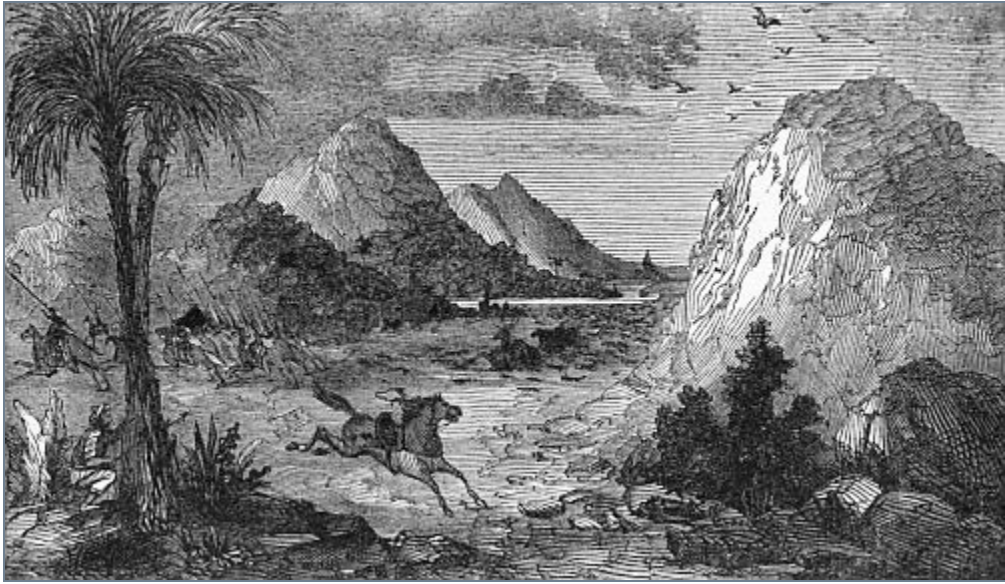
THE INDIAN GOLD HUNTER.