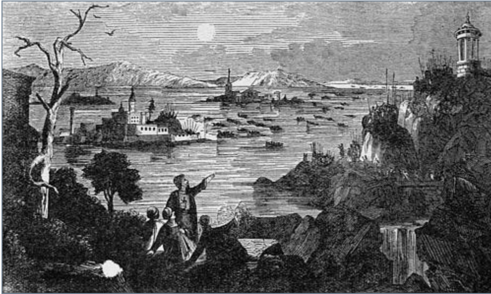
THE INVASION OF GREECE.

The mighty fleet advanced thus, by slow degrees, from conquest to conquest, toward the Athenian shores. The vast multitude of galleys covered the whole surface of the water, and as they advanced, propelled each by a triple row of oars, they exhibited to the fugitives who had gained the summits of the mountains the appearance of an immense swarm of insects, creeping, by an almost imperceptible advance, over the smooth expanse of the sea.