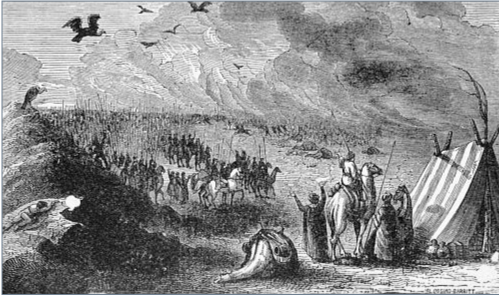
THE ARMY OF CAMBYSES OVERWHELMED IN THE DESERT.