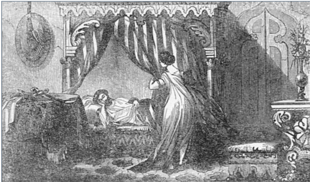
PHAEDYMA FEELING FOR SMERDIS'S EARS.

Otanes immediately made the case known to two of his friends, Persian nobles, who had, with him, suspected the imposture, and had consulted together before in respect to the means of detecting it. The question was, what was now to be done. After some deliberation, it was agreed that each of them should communicate the discovery which they had made to one other person, such as each should select from among the circle of his friends as the one on whose resolution, prudence, and fidelity he could most implicitly rely. This was done, and the number admitted to the secret was thus increased to six. At this juncture it happened that Darius, the son of Hystaspes, the young man who has already been mentioned as the subject of Cyrus's dream, came to Susa. Darius was a man of great prominence and popularity. His father, Hystaspes, was at that time the governor of the province of Persia, and Darius had been residing with him in that country. As soon as the six conspirators heard of his arrival, they admitted him to their councils, and thus their number was increased to seven.