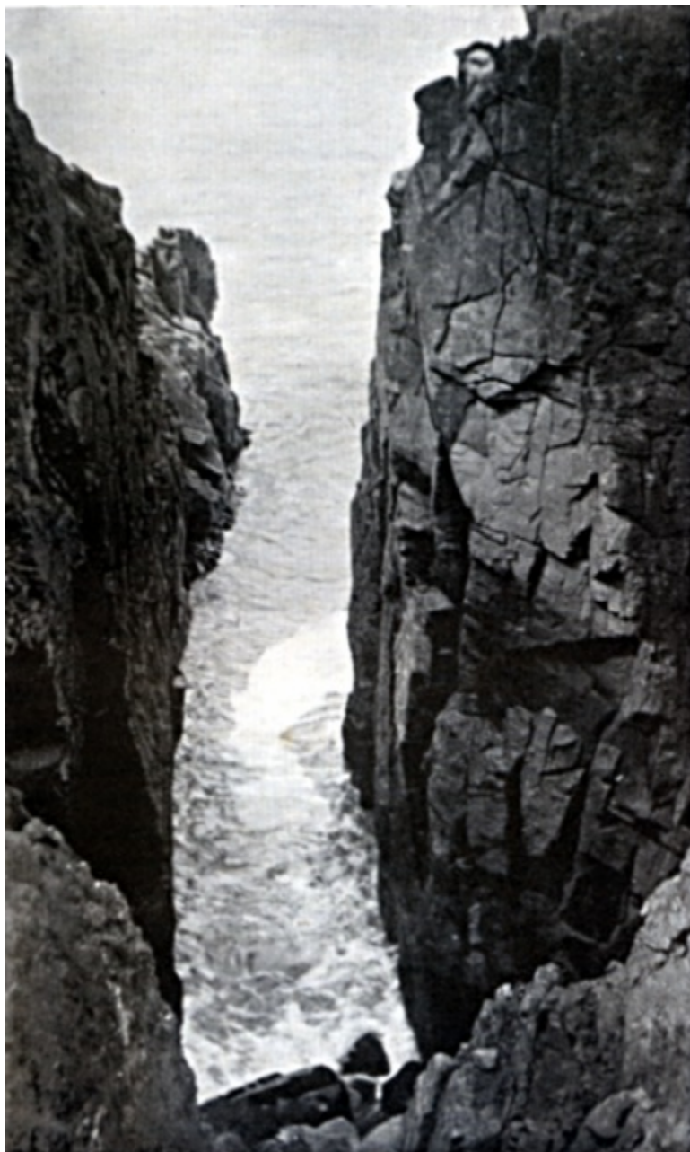
THE CHASM OF THE BOUTIQUES. "The tide was still churning among its slabs and boulders."

And I went in, and found him sitting up in great excitement at all the talking. I shook him very heartily by the hand and clapped him on the back and told him how much we were indebted to him, and how it was his prompt warning that enabled me to get across to Herm before they set their patrol boats--and very briefly of what had passed and was toward, and so left him, content and cheerful.