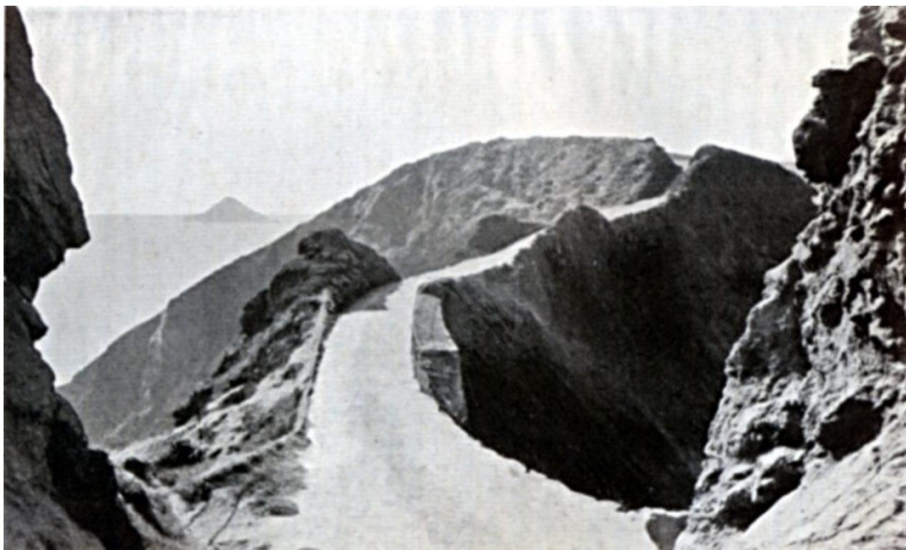
THE COUPEE. Leading from SARK to LITTLE SARK. At the time of the story, the path was much narrower than now, there were no supporting walls, and it was continually breaking away. The pinnacles of the buttresses were also much higher. The Island to the left is LE TAS or L'ETAC.

who sat of her own choice between me and death--and I knew that she loved me as I loved her, and my heart was full and glad in spite of the hunting Death behind.