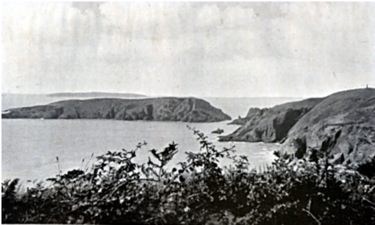
BRECQHOUE FROM THE SOUTH. "I looked across at BRECQHOUE as I came in sight of the Western Waters." This shows BRECQHOUE from the south. The dark gash near the head is THE PIRATES' CAVE. The island behind BRECQHOUE is HERM. The end of JETHOU just shows on the left. GUERNSEY lies beyond them.

"God's mercy!" I said, and we sped up the steep Creux Road, among the ferns and flowers and overhanging trees.