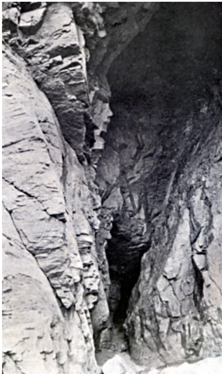
IN THE CLEFT OF A ROCK.