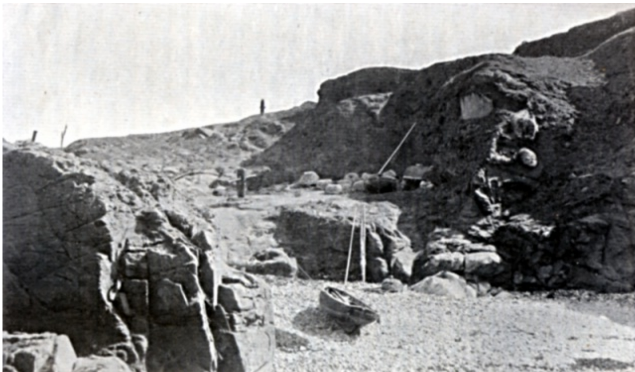
EPERQUERIE BAY. Showing the bluff from which the men of SARK fired down on the men of HERM as they landed the boats.