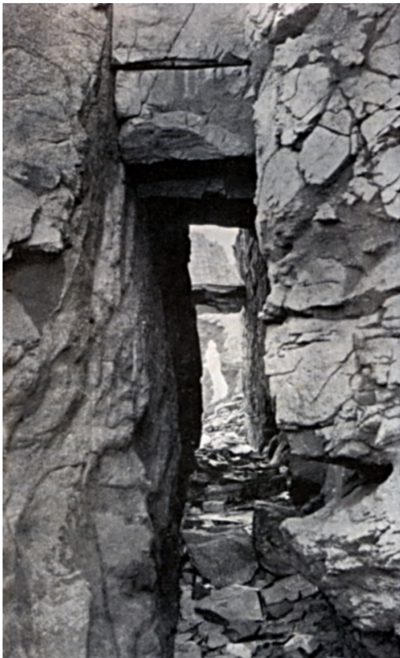
THE LADY GROTTTO. "We knew every rock and stone, and every nook and cranny of the beetling cliffs." This is the