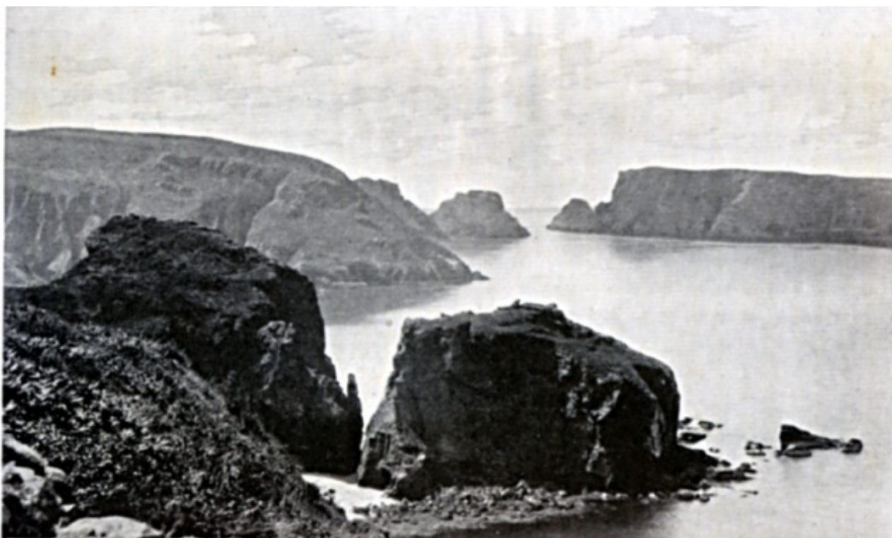
TINTAGEU. The great detached rock in foreground is TINTAGEU; to the left, the altar rock on which Phil used to lie; the bay behind is PORT ALA JUMENT with BELFONTAINE in the cliffs at the head of it; in the foreground THE GOULIOT ROCKS and PASSAGE; on the right BRECQHOU.

At all of which the silvery little voice would say "Pooh!" But all the same the slim little figure would shiver in the hot sunshine inside its short blue linsey-woolsey frock, and the dark eyes would grow larger than ever at the prospect, especially at the ripping by the giant pieuvre, in which they both believed devoutly, and eventually she would promise not to throw her young life away.