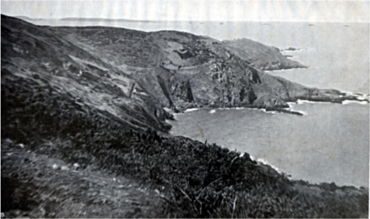
THE EPERQUERIE. Above the shoulder of the hill to the left, JETHOU just appears; the larger island with the long painted beak is HERM, with her string of islets like a fleet of ships speeding to the north. The lower of the two out-jutting headlands is where the Herm men landed. The higher is BEC DU NEZ, the most northerly point of SARK.