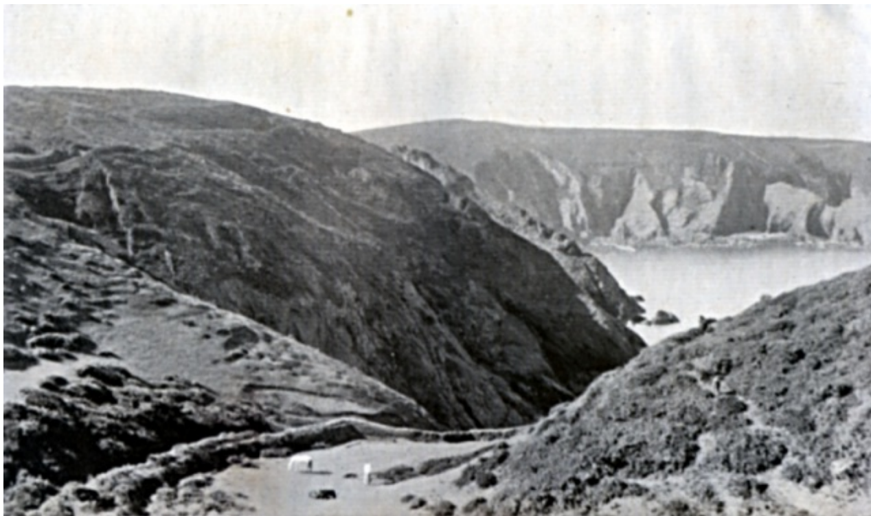
BELOW BEAUMANOIR. "And in Sercq, the headlands were great soft cushions of velvet turf, the heather purpled all the hillsides, and, on the gray rocks below, the long waves shouted aloud because they were free." This is the slope below "BEAUMANOIR," looking into PORT ES SAIES.

In building the prison in so marshy a district, advantage had been taken of a piece of rising ground. The enclosure was built round it, so that the middle stood somewhat higher than the sides, and standing on that highest part one could see over the sharp teeth of the stockade and all round the countryside.