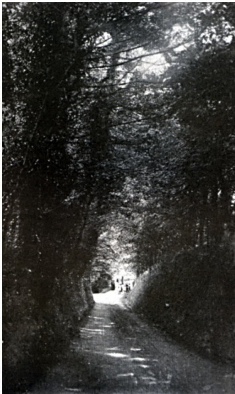
A QUIET LANE. "The quiet gray lane, with its fern-covered banks and hedges of roses and honeysuckle."

"Aw, I know! Gallop away back, my boy. And--say, Phil, mon gars,--don't let that young cub from Herm get ahead of you. He's been making fine play while you've been away." And I waved my hand and sped back to the merrymaking.