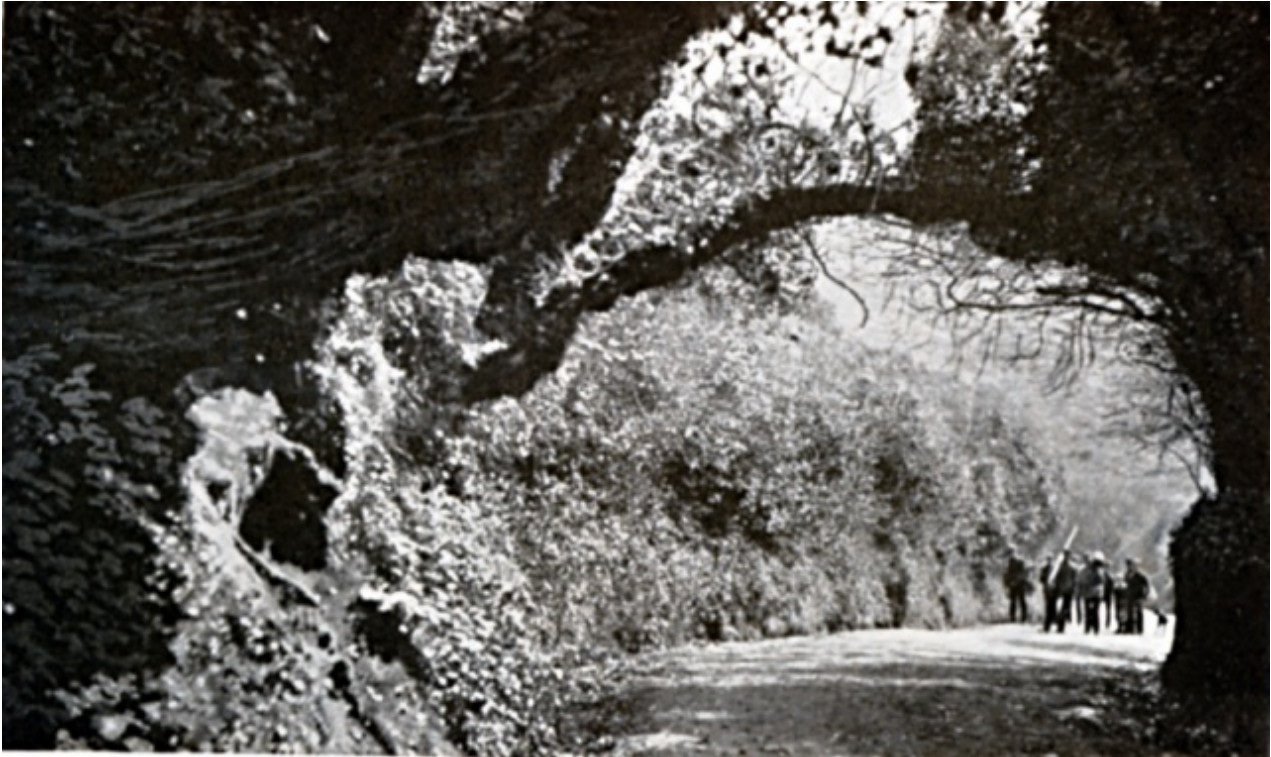
THE CREUX ROAD, Which leads straight up to the life and centre of the Island.

The great seamed rocks of the headlands are black, and white, and red, and pink, and purple, and yellow; while up above, the short green herbage is soft and smooth as velvet, and the waving bracken is like a dark green robe of coarser stuff lined delicately with russet gold.