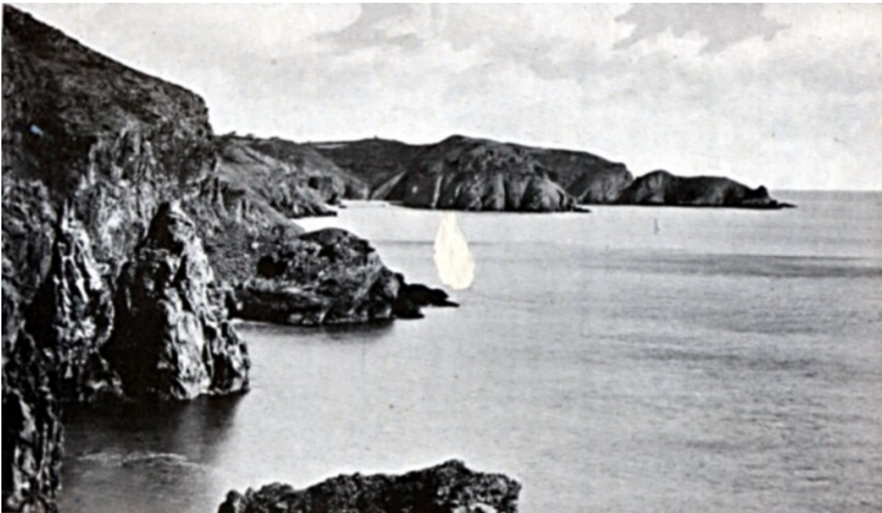
DIXCART BAY. Where the Herm men landed, is in the centre of the picture, right below the ruined mill on HOG'S BACK. The straight-walled cliff on the right of the bay is where the Sark men took their stand. The out-stretching point on the right is DERRIBLE.

He and the rest went on up the hillside to Les Laches, and we four set to work hauling and piling, till the seaward mouth of the tunnel leading from the road to the shore was barred against any possible entrance. And listening anxiously through our barrier, with the stillness of the tunnel behind us, we presently heard the sound of the toiling oars pass slowly on towards Dixcart. We waited till they died away, and then climbed the hill to Les Laches and sped across by the old ruins, with a wide berth to the great Creux at the head of Derrible Bay, and down over the Hog's Back into Dixcart Valley, where we knew, and they knew, their best chances lay. For in Dixcart the shore shelves gently, and the valley runs wide to the beach; fifty boats could land there in a line, and their crews could come up the sloping way by the streamlet ten abreast. It would be no easy place to defend if the enemy pushed his attack with persistence, and every man we had would be needed.