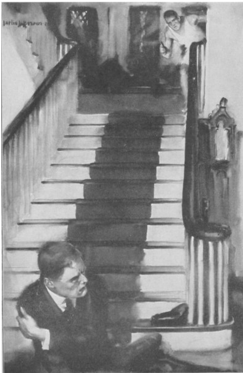
At the crack of the gun the fugitive stopped short

The frame of the photograph of the young girl that had so charmed him lay on the floor face down. Bennett picked it up and found that the picture had been removed. He wondered a little at this but dismissed the subject from his mind to consider the graver business of how to avoid the disagreeable consequences of his encounter. He must leave the house and escape from Bailey Harbor before daybreak, and he went upstairs and hurriedly began dressing.