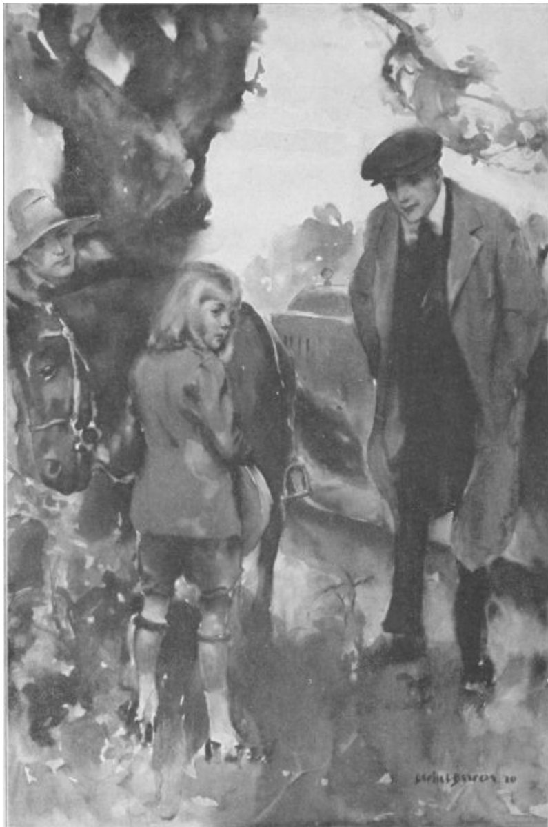
"We must be in a hurry or that woman will catch you"

At the same moment two men sprang out of the second car and rushed at Archie. One of them flung a carriage robe over his head and twisted it round his throat, then they gathered him up, head and heels, and tossed him over the fence. The thing could not have been managed more neatly if it had been rehearsed. The Governor leaned over the fence and gazing upon Archie, wriggling in a patch of briars, unconcernedly recited: