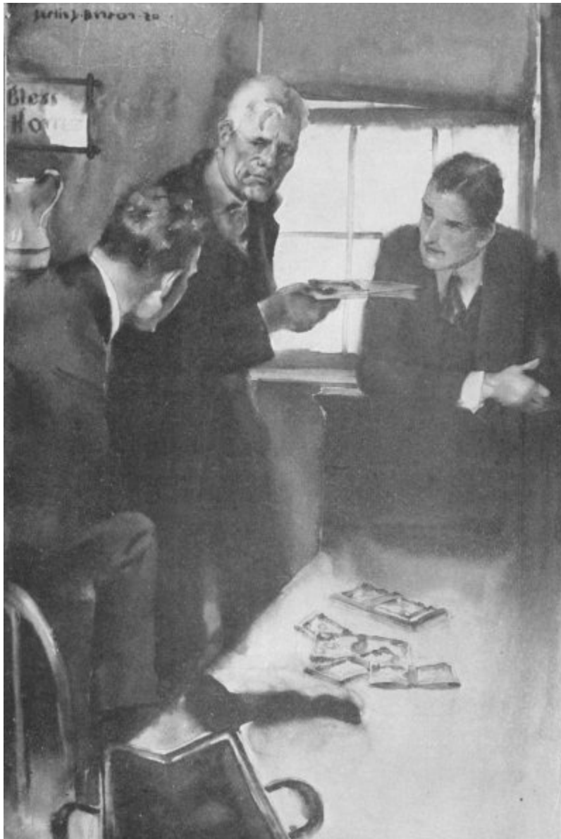
"It's all right about you, Governor, but the kid better shake the tree"

"No hard feeling; most certainly not! My young friend is only proud to serve a man of your standing in the profession. It is possible that later on you may be able to render us a service. You never can tell, you know, Red."