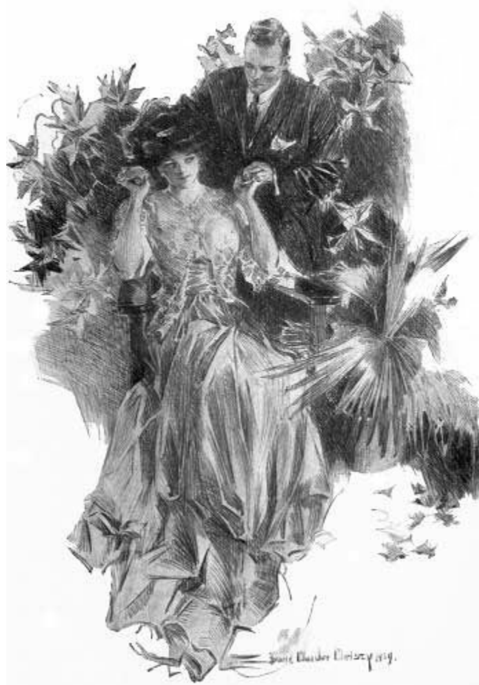
He felt the thrill that ran through her veins

"It is my home, too, Alec," she cooed. "I was born in Vermont. We are going home together."