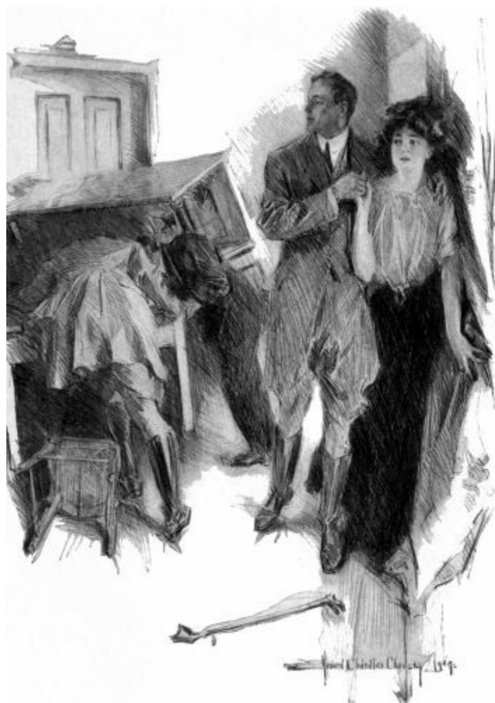
Beaumanoir and Felix fortified the position

Poluski, all trembling with excitement, slammed and locked the door and pointed to a heavy sideboard. "Drag it here!" he shrieked in a high falsetto. "The street is crammed with men belonging to the Seventh Regiment, and they have a short way with Kings they don't like. The instant they see how they have been tricked they will be after you like a pack of wolves. I have sent a messenger for help. I dared not use one of your orderlies, because that would have given the game away. While the men sit their horses out there the mutineers may believe you will soon reappear. Nevertheless, block the doorway with all the furniture. We must gain ten minutes at least, or it may be twenty."